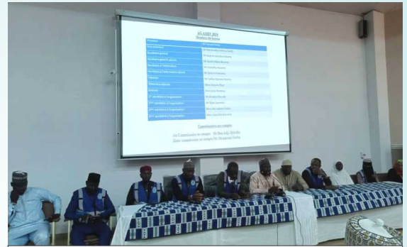
New executive committee for IMA Niger Republic