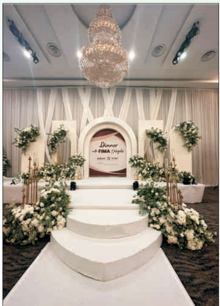
Dinner is ready: An Nur Specialist Hospital arranged a grand gala dinner

of FIMA (2017-2021) was unanimously elected as a member of FIMA advisory council.