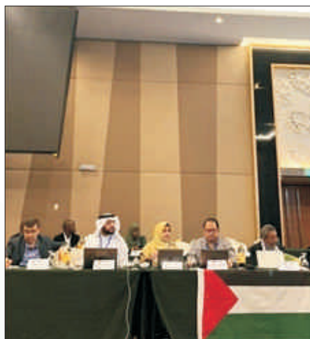
Opening session of the 40th FIMA Council meeting