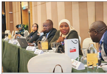
Another view of day 2 of 40th FIMA council meeting.