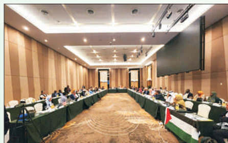
A panoramic view of the council meeting, day one