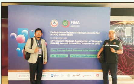
The scientific session day one morning 27th October 2023.