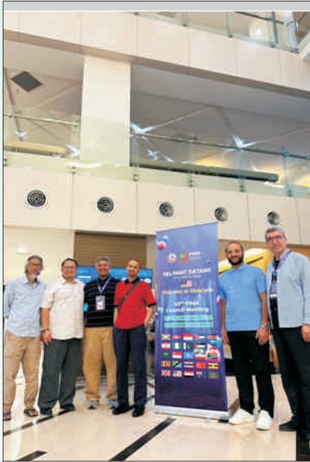
Ready for joining the scientific session