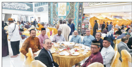
FIMA family, the present and past FIMA presidents at the gala dinner hosted by Al Islam Specialist Hospital in Nashrul Quran Complex