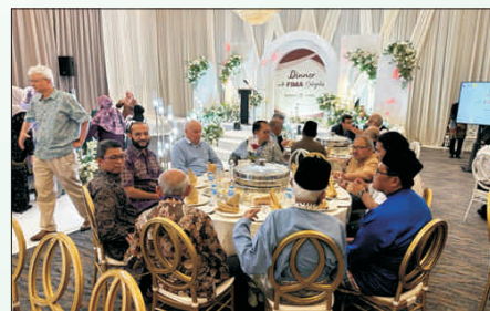
A sumptuous dinner was hosted by An Nur Specialist Hospital in Bangi