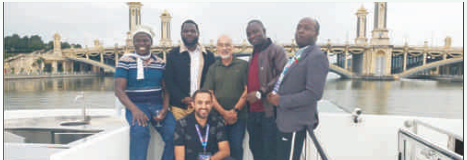
Sight seeing tour exploring Putrajaya