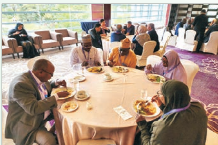
The African IMAs at the luncheon having a social meeting.