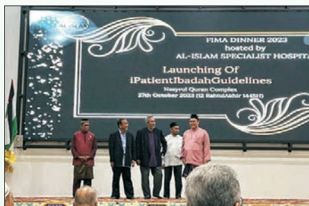
Launching of iPatient Ibadah guidelines in the evening of 27th October 2023