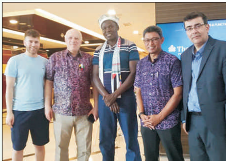
FIMA delegates socializing.