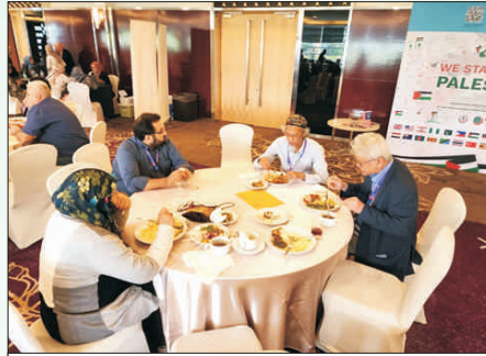
Lunch break on day of FIMA council meeting