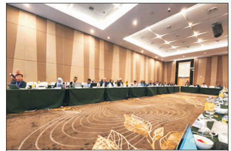
Reporting session in progress, FIMA council meeting.