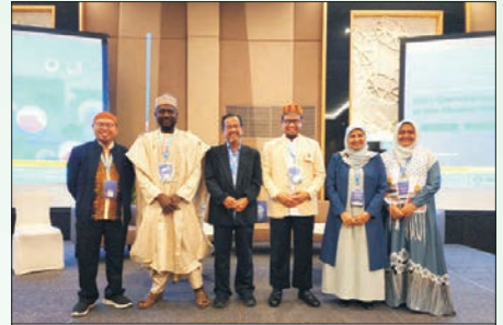
Speakers of Islamic Hospital Consortium (IHC)