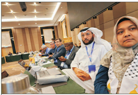
A view of day 2 of 40th FIMA council meeting.