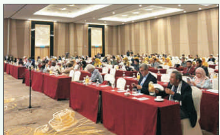
Inaugural session of IMAM annual scientific convention