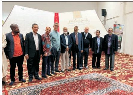
Nashrul Quran Complex, Putrajaya