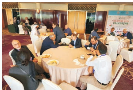
Lunch break on FIMA council meeting.