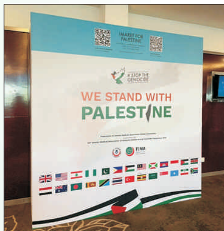
IMARET put a stand for solidarity with Palestine and it was later signed by all the delegates

FIMA ExCo has been actively deliberating on the formulation of “2030-FIMA Strategic Plan” since