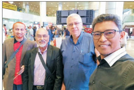
At the airport, arrival of FIMA leadership from USA, Lebanon and Bangladesh.