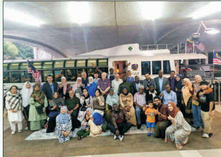
Sight seeing tour on a Putrajaya lake cruise