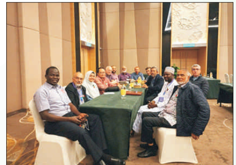
Post council FIMA ExCo meeting.