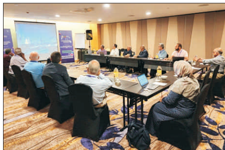
FIMA pre council ExCo meeting on 24th October 2023.