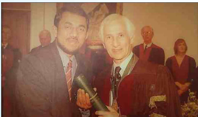
(2002, receiving FRCP degree in UK)