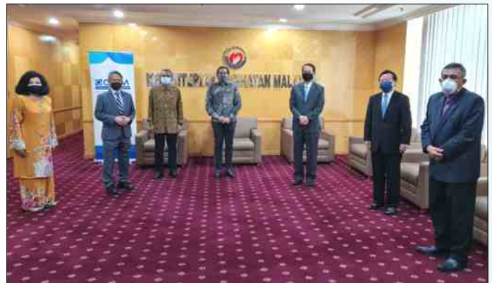
(2020 with minister health and DG health at the meeting of "Clinical research Malaysia")