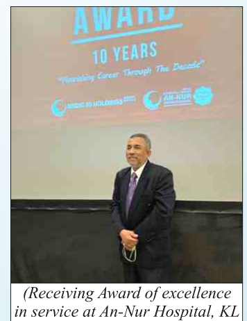
(Receiving Award of excellence in service at An-Nur Hospital, KL