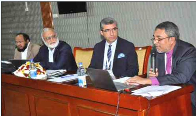
(In FIMA council meeting Kampala, Uganda - 2019)