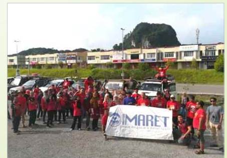
IMARET outreach Orang Asli at Pos Gob.