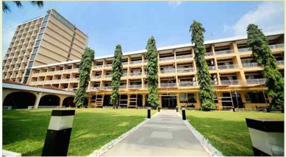
Hotel Africana, the venue of 36th FIMA council meeting and International scientific conference.

The FIMA Consortium of Islamic Medical Colleges (CIMCO) in conjunction with the Islamic Medical Association of Uganda (IMAU) will conduct a parallel consultation session for participants not attending the FIMA Council meeting on