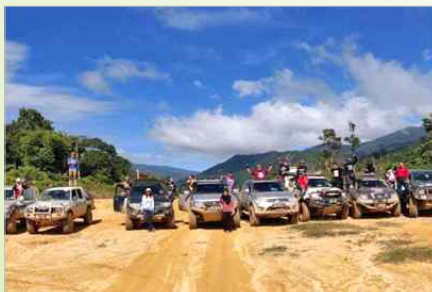
All set for IMARET flood relief team going to Pos Gob and Gua Musang for monthly orang asli outreach.

program, Safe water project and chain of charity clinics in collaboration with IMAM and other bodies including educational institutions.