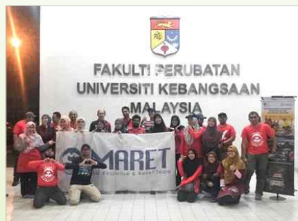
Collaboration with Kebangsaan University Malaysia.