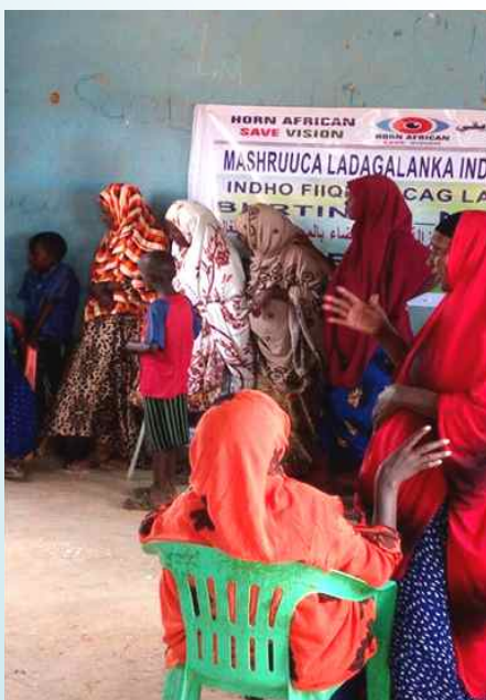
Burtinle July 2016