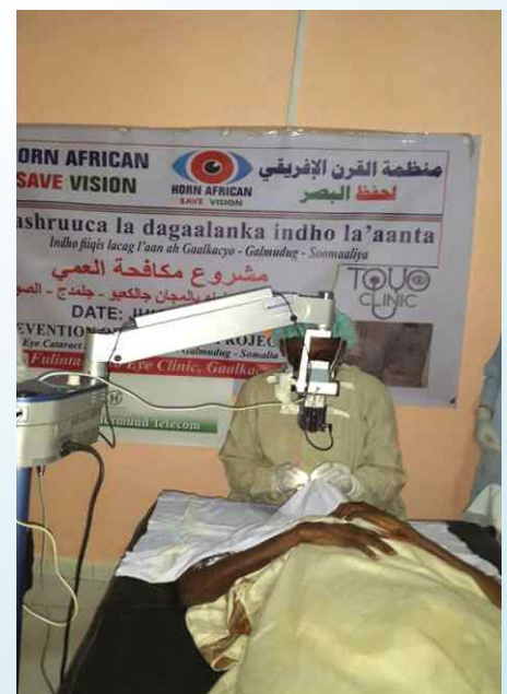
Galka'yo, July 2016