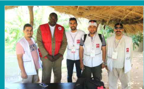
DWW Turkey relief team in Chad.