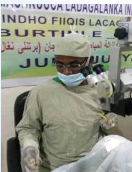
Burtinle, July 2016