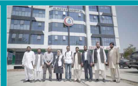
Afghanistan IMA office bearers with DWW Turkey relief team