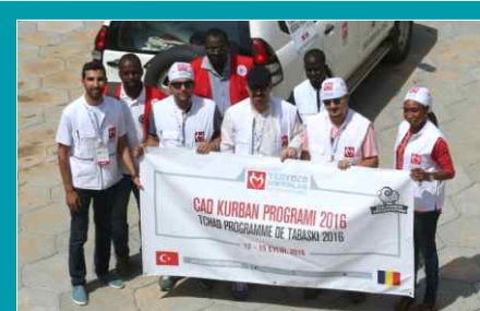
DWW Turkey relief team in Chad.