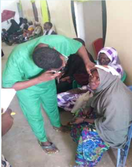
Burtinle, July 2016

you. If you want to participate in our project of prevention of blindness by funding, we will appreciate it. If you plan to perform eye camps in Somalia, we would like to be your partners".