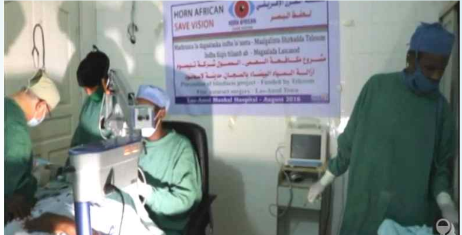
Laascaanood, August 2016