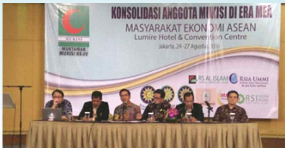
Discussion about how to strengthening the role of Medical profession in Asean Economic Community (AEC), with panelist from IIMA (Indonesian Islamic Medical Association), FOKI (Indonesian CIMCO), IMANI ( Islamic Medical Association Network of Indonesia), Indonesian Nurse Association and IHC Malaysia