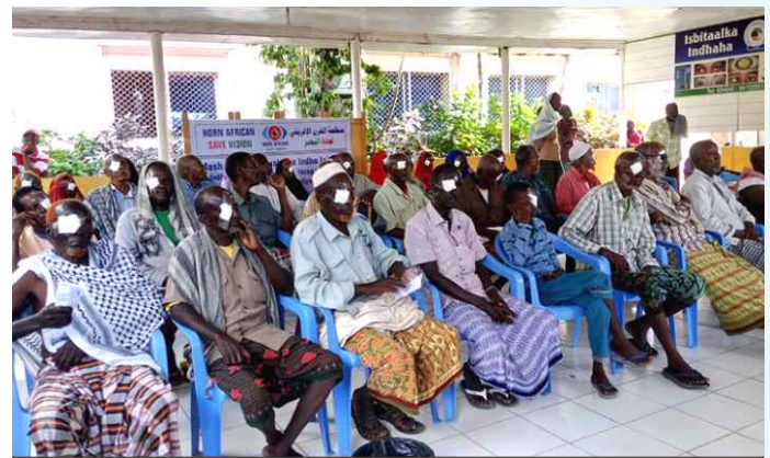
Mogadishu, June 2016