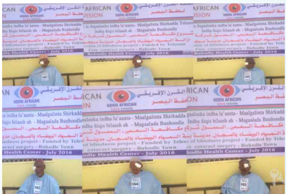
Our way of documentation. One patient one photo.