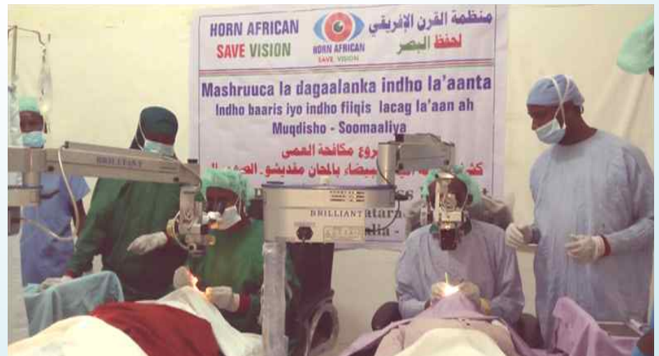
Horn African' 1st Free Eye Camp in Mogadishu, June 2016

The Horn African Save Vision team consists of the graduates from FIMA-Hargeisa University Alumni, they are all highly motivated eye surgeons ready to volunteer their services for the noble cause of fighting the menace of blindness especially in horn of Africa. Their