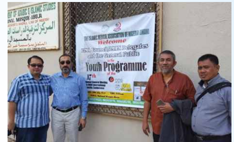
Medical Students camp held at National Mosque auditorium, Abuja