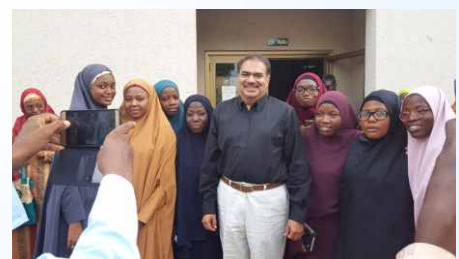
Medical students with FIMA President during the Students camp held at National Mosque auditorium, Abuja