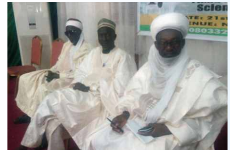
The IMAN leadership form Kano and Sokoto.