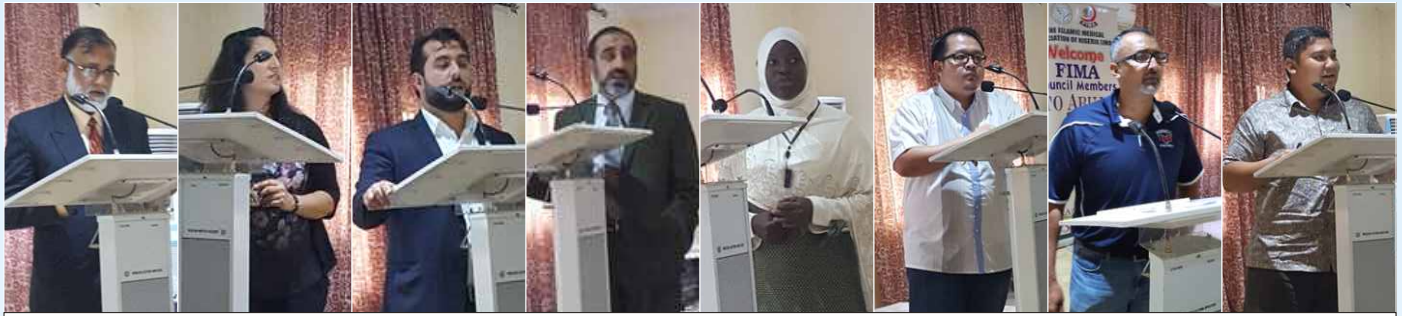
Speakers at the FIMA Council Meeting and FIMA-IMAN Scientific Conference

members who shared their wisdom and expertise.