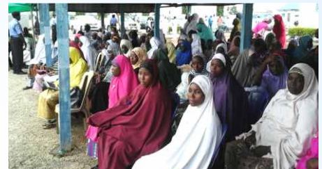
The patients and attendants at the Fistula camp held from 16-18th July 2016 UMY Memorial Hospital, Niger state.