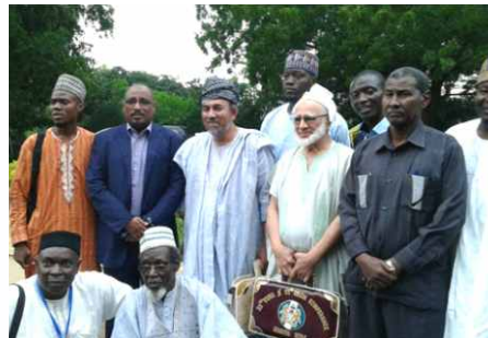
Delegates in traditional Nigerian attire.