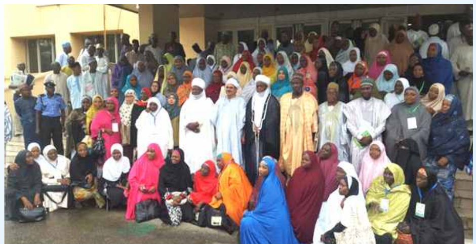
Inaugural Ceremony of the FIMA-IMAN Scientific Meeting in Hotel Nikon Luxury Abuja. Sultan of Sokoto and FIMA-IMAN office bearers with Sisters.

The 33 rd FIMA council meeting was held in the Ahmad Bello Hall, Hotel Stone hedge, Abuja. It was a very well attended meeting and more than forty delegates from 14 countries attended. The meeting discussed the reports of