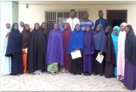
Award of certificates to the students delegates