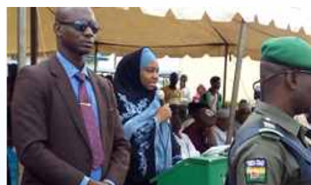
The representative of first lady of Nigeria at the opening ceremony of VVF camp.