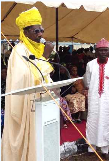
Chief Guest at the opening ceremony.