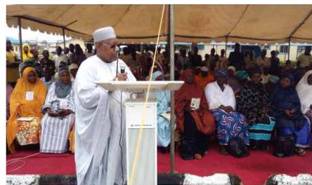
Fistula camp held from 16-18th July 2016 UMY Memorial Hospital, Niger state.