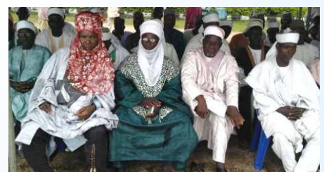
The dignitaries at the Fistula camp held from 16-18th July 2016 UMY Memorial Hospital, Niger state.