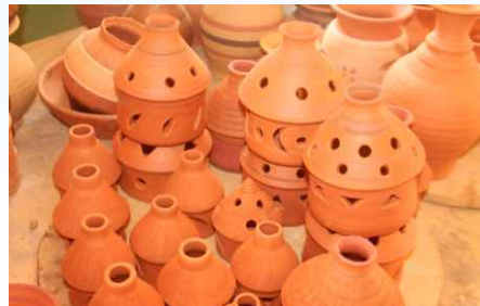
Pottery art in the process of final finishing.