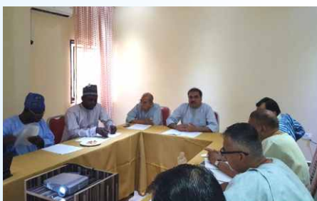
A view of FIMA post council meeting in progress.