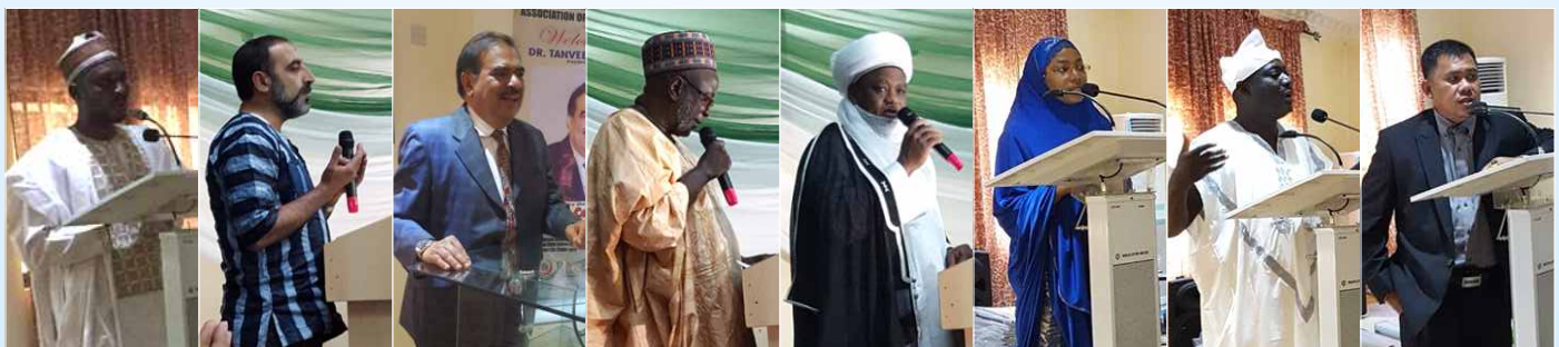
Speakers at the FIMA Council Meeting and FIMA-IMAN Scientific Conference