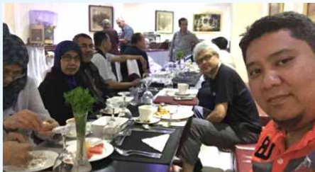
Excellent hospitality by the local hosts, the FIMA family relaxing after a sumptuous meal, Hotel Stone Hedge.