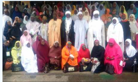
Female delegates and medical students with chief guests.