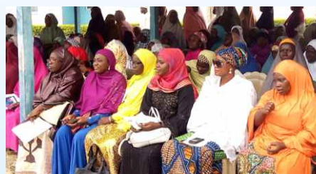
The dignitaries at the Fistula camp held from 16-18th July 2016 UMY Memorial Hospital, Niger state.