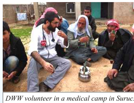
DWW volunteer in a medical camp in Suruc.

of Hayat Foundation. He said the Turkish brothers were excited to see and welcome the FIMA family in Istanbul next summer.