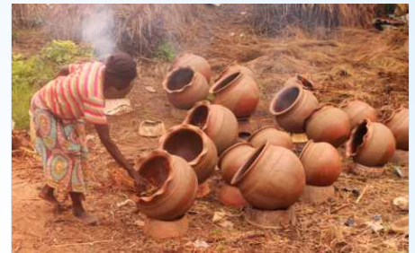
A potter is examining the pitchers for any flaws and leaks.