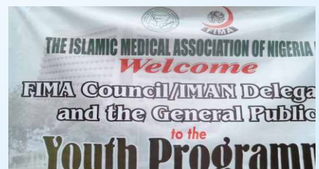
The youth program attracted hundreds of medical students from various states and provinces.