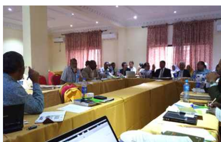
Day 1 of the 33rd FIMA Council in Abuja (19th July)