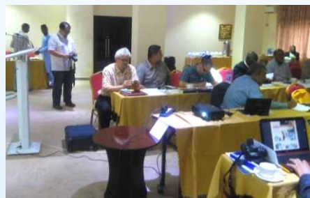
Day 3 of the FIMA council meeting, 20th July 2016