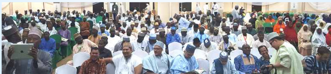
International FIMA delegates in the Inaugural Session.