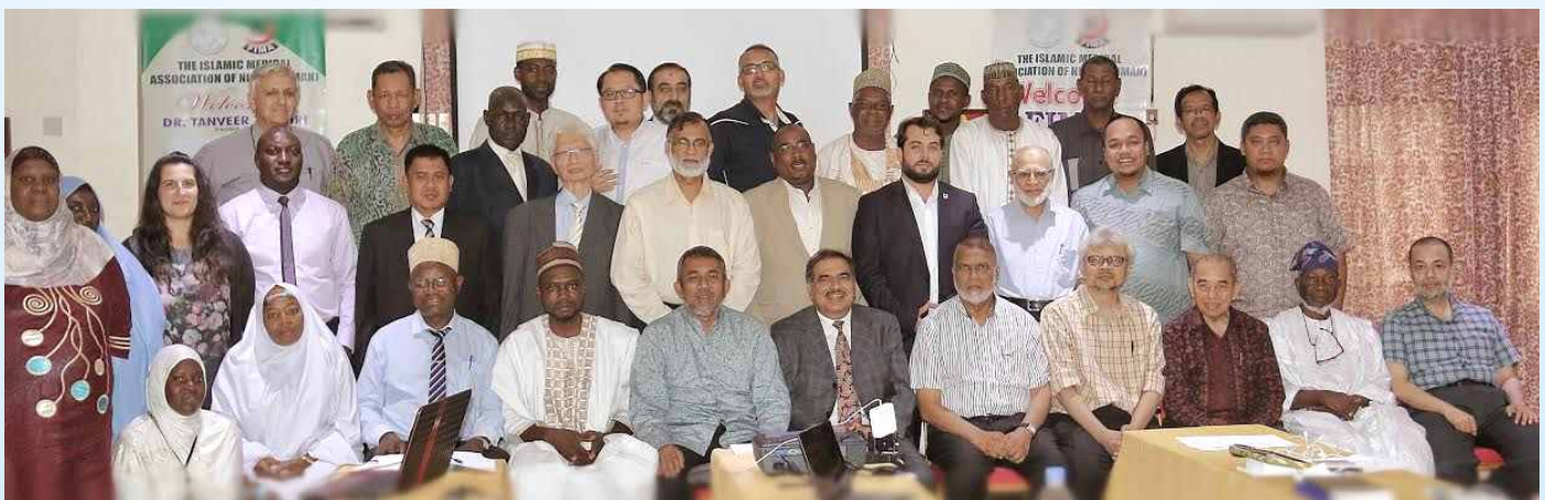
The participants of 33rd FIMA council meeting held on 19-20 July 2016 Abuja Nigeria.