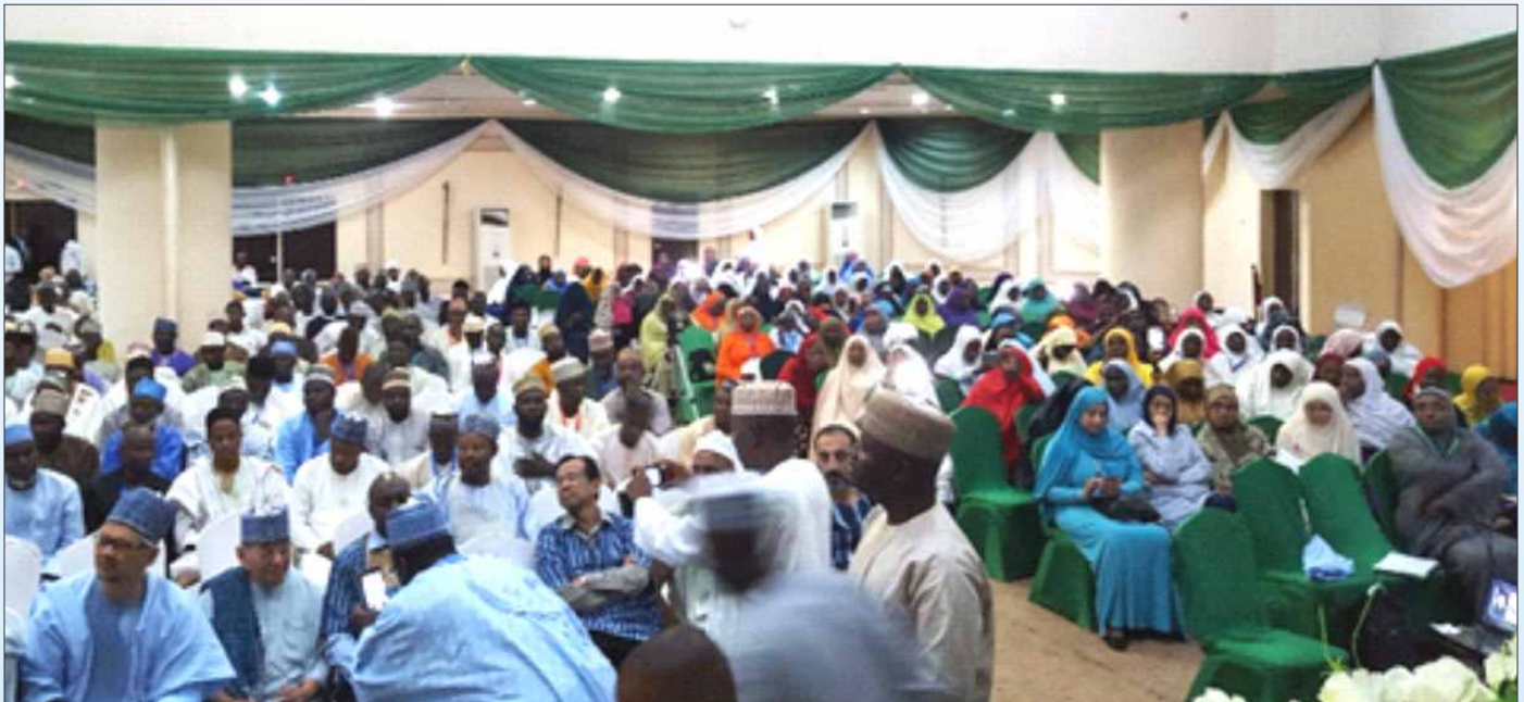
International FIMA delegates in the Inaugural Session.