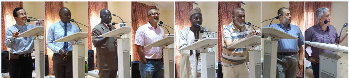
Speakers at the FIMA Council Meeting and FIMA-IMAN Scientific Conference