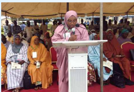
A view of opening ceremony of Fistula camp.