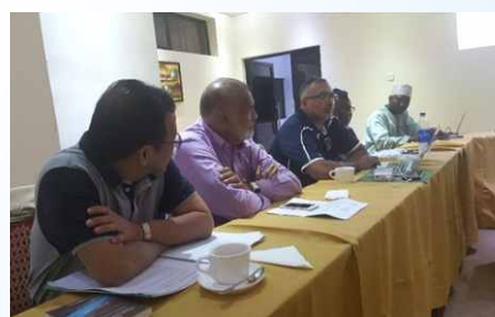
Day 1 of the 33rd FIMA Council in Abuja (19th July)