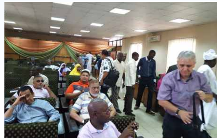
Medical Students camp held at National Mosque auditorium, Abuja