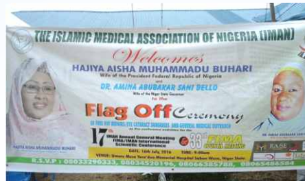
First lady of Nigeria, Hajiya Aisha Buhari was the patron of the Fistula camp.