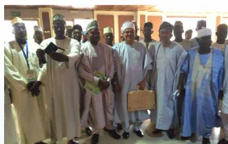
FIMA President and secretary with delegates from IMAN.