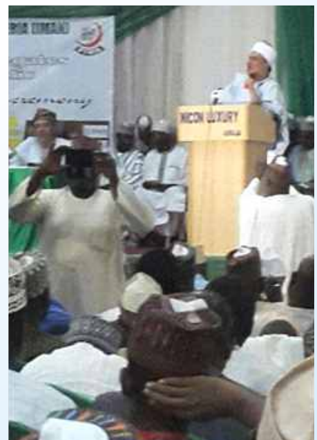
Inaugural ceremony of the FIMA-IMAN Scientific meeting in Hotel Nikon Luxury Abuja.