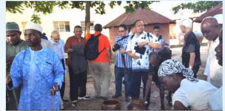
A visit to Ushafi pottery village in the Bwari area of Abuja.

The delegates took interest in viewing the various steps of making of utensils and ceramics by the tribeswomen. The village has gained international fame and the visitors included US Presidents and several other head of states.