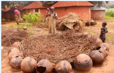
Traditional method of burning fire for the reinforcement.