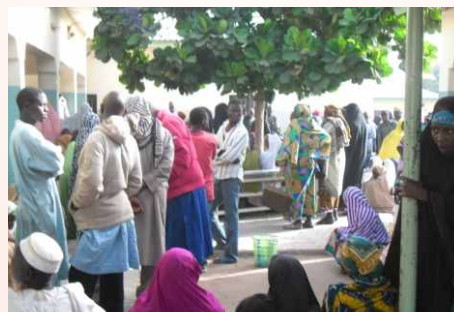
Patients waiting outside