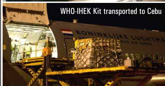
WHO-IHEK Kit transported to Cebu