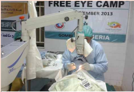
Gombe Nigeria Free Eye Camp