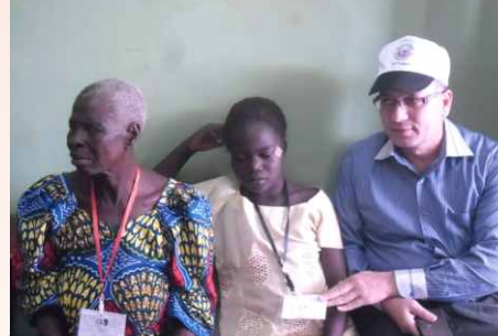
IIRO Representative in the camp