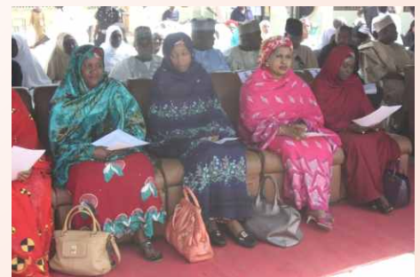
Guest in opening ceremony of camp