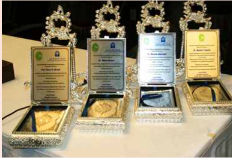
Souvenirs presented to the speakers