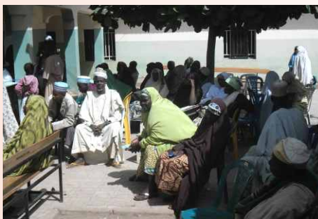
Patients waiting outside

This was the first time that IMAN participated in the free eye camps organized by the FIMA Save Vision in Nigeria and the leadership of IMAN is very much enthusiastic to actively participate in future camps.