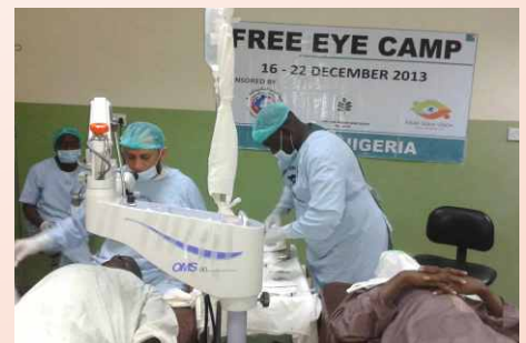
Gombe Nigeria Free Eye Camp