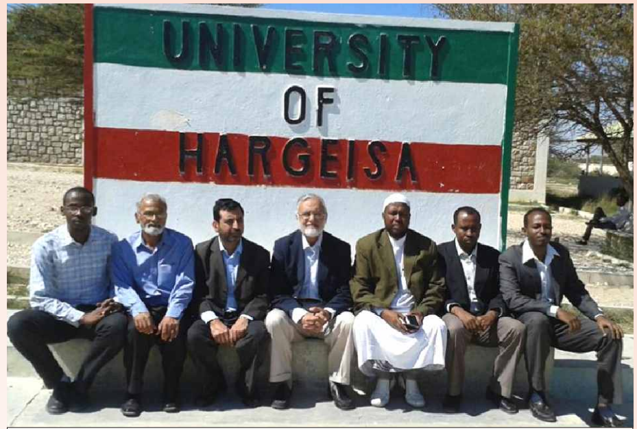
Course organizers & the M.Sc diploma students