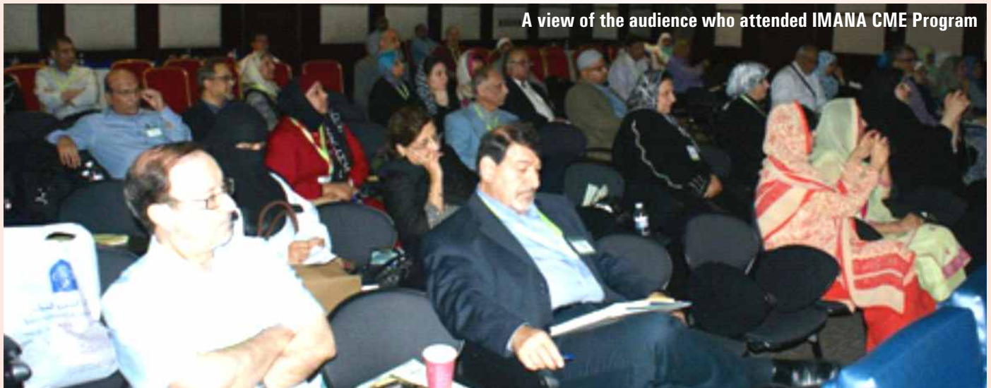
A view of the audience who attended IMANA CME Program