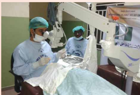
Gombe Nigeria Free Eye Camp