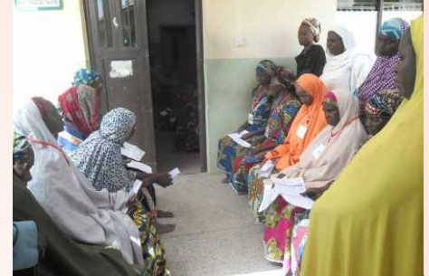
Patients waiting outside the hospital