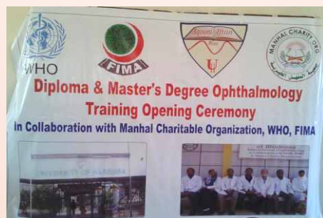
Inauguration of the M.Sc course