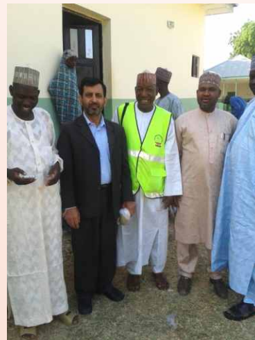
Director FIMA Save Vision with IMA Nigeria Fellows