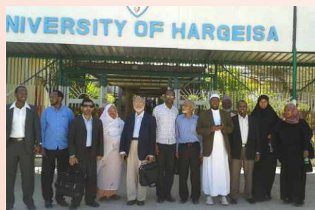
Orientation course-Day 1 in the eye department of University of Hargeisa