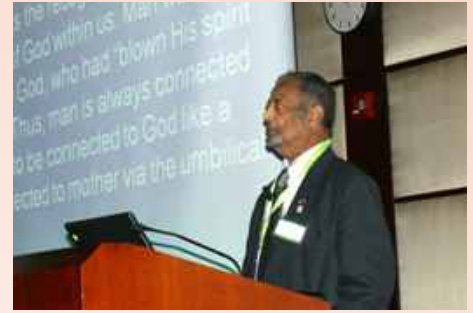
A talk on spirituality and medicine