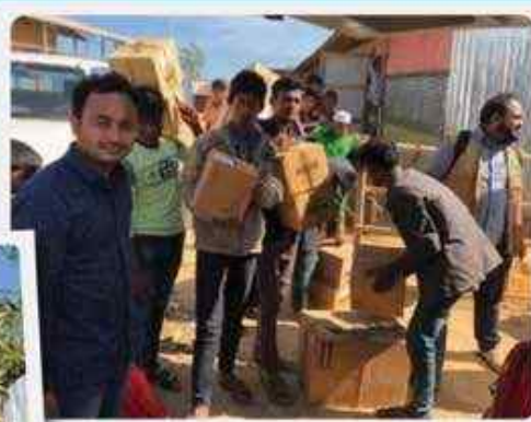
Wages to each Rohingya youth we train, sustains a whole family