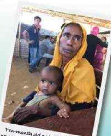
Ten-month old orphan child. Both parents shot dead by Burmese Army. He escaped with grandparents 3 months ago.