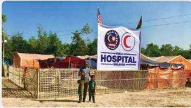
Field Hospital at Ukhiya, Cox's Bazar