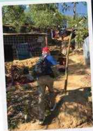
A long walk and climb to our clinic which is perched on the hill top. One must be fit for duty