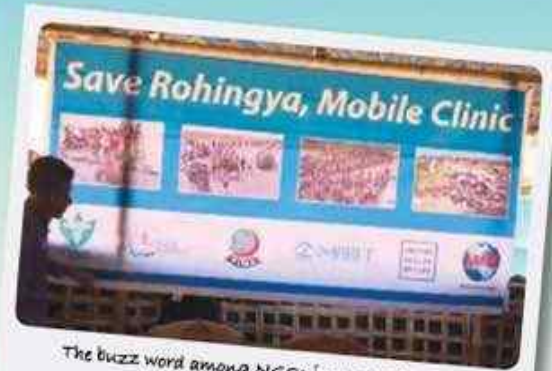
The buzz word among NGOs is cooperation and coordination.