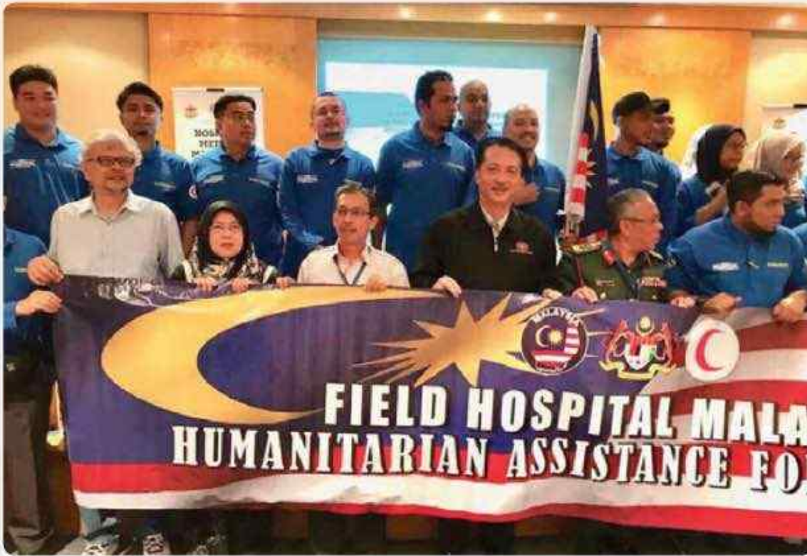
DG MOH flag off Team A Field Hospital Malaysia on 26 Nov 2017

IMARET and our Bangladesh partners CSBD (Charity Society of Bangladeshi Doctors) have organised 52 MC (Mobile Clinics) deep in the hearts of the refugee camps, where few have accessed. Our team consisted of 8-10 doctors, 3-4 Rohingya interpreters, 3-4 Rohingya "village doctors" and many more Rohingya workers (all salaried, thus taking care of their whole families).