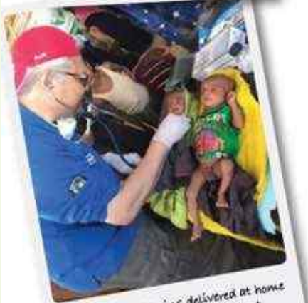
Seven day old twins delivered at home by traditional birth attendant.

Notwithstanding the apathy, the few who volunteered were focused towards care, love and compassion for the refugee patient. And we endeavoured to diagnose and treat them with best clinical practises (or minimum accepted standards of care) peppered with mega doses of respect and honouring their dignity and humanity.