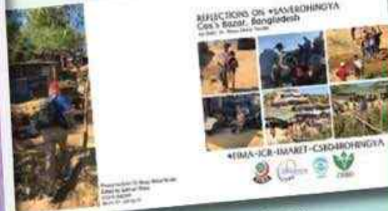
Photobook of my Cox' Bazar rendezvous

Paediatrician wanted for Malaysian Field Hospital for 15 February – 8 March 2018. Interested,