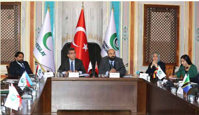
A view of the meeting of Green Crescent societies ExCo.