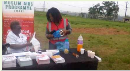
Community outreach program to create awareness against the menace of AIDS

The IMASA KZN Branch & Muslim AIDS Programme [MAP] team created HIV awareness at all the four of the IMASA clinics and at Alberto Hospital in KZN on the 01st December 2017.