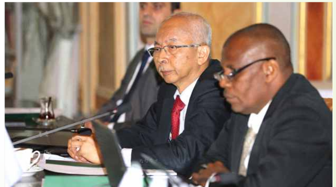
Another view of the meeting.