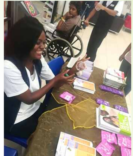
Specially designed motivational material and literature was distributed.