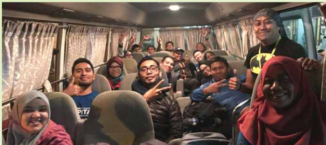
En-route to FH. Surprisingly the 17 team member who missed their connecting flight to Cox's looks highly spirited! Wait till they sampai @ FH nanti :)