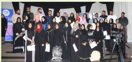
The smiling faces and high spirits, they were given the message to always remember their roots and most importantly, the Almighty, without whom, their achievements would all not have been possible!

IMASA members. The graduates were encouraged to: greet the future with anticipation, dream big and work hard, always to remember your roots and most importantly, the Almighty, without whom, this would all not have been possible!