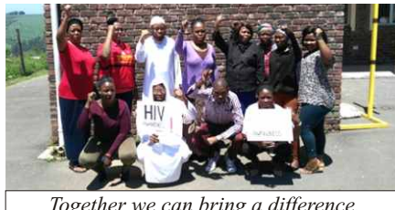
Together we can bring a difference, Islam brings peace and disease free society through an ideal lifestyle