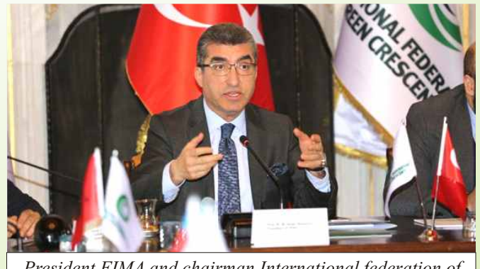
President FIMA and chairman International federation of Green crescent societies