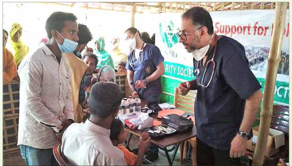
IMASA (Islamic Medical Association of South Africa) doctors in the medical camp attending the sick