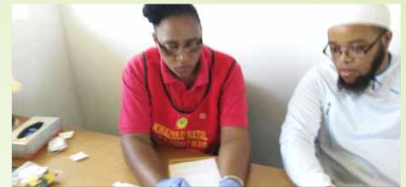
Ulema & scholars were also taken on board to appraise the religious injunctions against adultery and to promote chaste lifestyle.