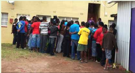
The free clinic was attended by a large number of locals