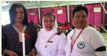
Awareness and community support can bring a remarkable change... World AIDS day