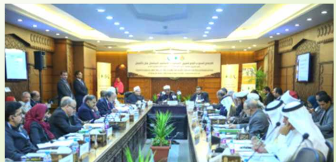
A view of IAG-WHO Meeting Cairo Egypt.