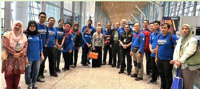
Team B of doctors & health care professionals en route to Field Hospital Malaysia (FHM) Cox Bazar. Team A served 1st one month in FHM. May their services & sacrifices be bountifully blessed