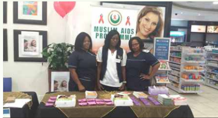
Muslim AIDS program was widely appreciated and acknowledged