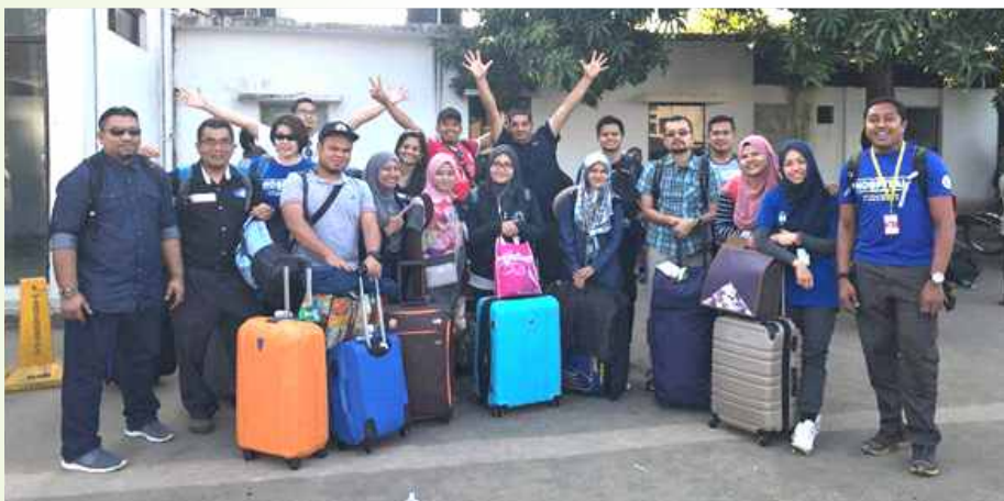
One month of service & sacrifice in Field Hospital FH @ Cox Bazar Our Sandakan physician (in blue and arms wide in air) will be terribly missed! He could stick a pink brannula into a paediatric patient! And he could bring the FH down with his funny bone :)