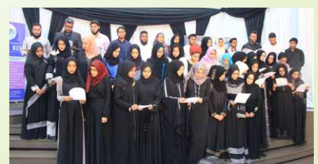
Greet the future with anticipation, dream big and work hard