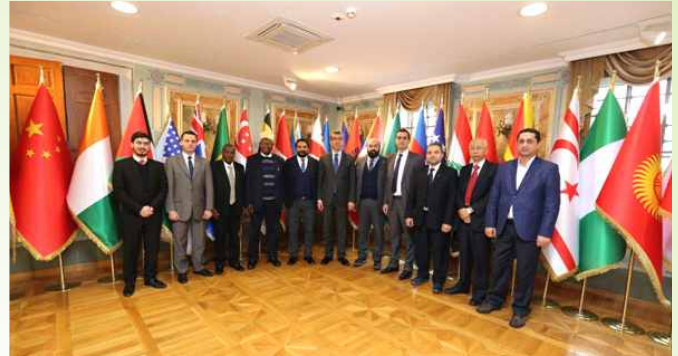
A Group photo of Green Crescent societies ExCo.