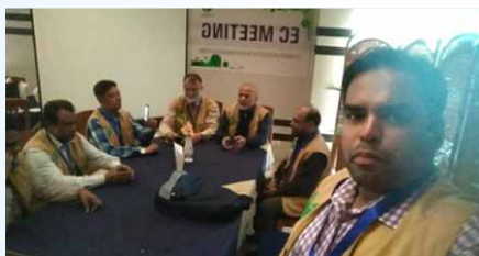
EC meeting of CSBD, main agenda, Rohingya crisis

5. Appeal to the government of Bangladesh to permit and