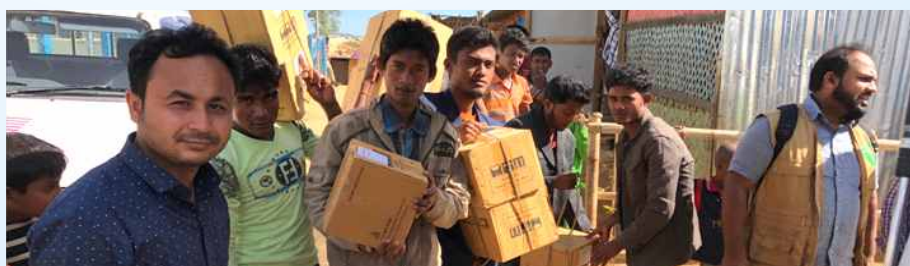
Our Rohingya Volunteers Assisting in the Mobile Clinics.