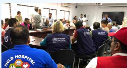
Cluster meeting of NGOs under UNHCR in Cox's Bazar